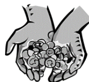
Tithes and offerings

"Each one must do as he has made up his mind, not reluctantly or under compulsion, for God loves a cheerful giver." -2 Corinthians 9:7