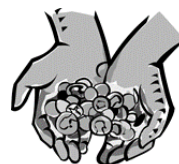
Tithes and offerings

“Each one must do as he has made up his mind, not reluctantly or under compulsion, for God loves a cheerful giver.” -2 Corinthians 9:7