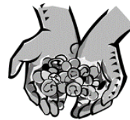
Tithes and offerings

Adult Envelopes (33).....$ 981.00 Children’s Envelopes (3).....$ 9.00 Loose Currency.....$ 45.34 Maintenance.....$ 175.00 Peter’s Pence.....$132.00