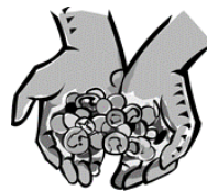
Tithes and offerings

"Each one must do as he has made up his mind, not reluctantly or under compulsion, for God loves a cheerful giver." -2 Corinthians 9:7