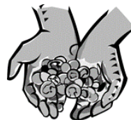
Tithes and offerings

"Each one must do as he has made up his mind, not reluctantly or under compulsion, for God loves a cheerful giver." -2 Corinthians 9:7