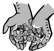
Tithes and offerings

"Each one must do as he has made up his mind, not reluctantly or under compulsion, for God loves a cheerful giver." 2 Corinthians 9:7