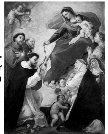
Luca Giordano, Madonna del Rosario, XVII sec., Museo di Capodimonte, Napoli

Our Lady gives St. Dominic the Holy Rosary.